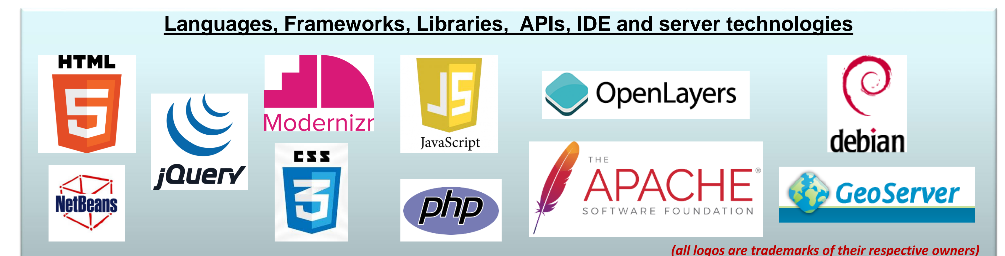
Figure 3: Technologies used for the deployment and development of the geoportal.

For the implementation stage of the geoportal, the IGFS CB endorses the use of open-source free software for its services (see Figure 3). The IGFS CB has already setup a web server for hosting its online applications. Debian Linux was selected for the operating system of the server and the Apache HTTP server for handling web requests. The geoportal will utilize the GeoServer software for sharing geospatial data with its end-users while the interface will take advantage of the OpenLayers API for providing dynamic maps. For the database of the server there are currently two possible options, the use of PostgreSQL (PostGIS) or MySQL.